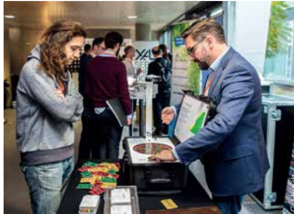
LSW 2016: Our sponsors had a chance to present and discuss their innovative lighting products to the conference participants.