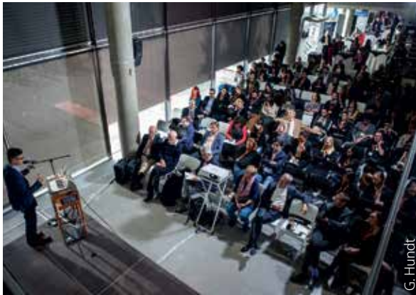
LSW 2016: The goal of the symposium was to present the effects of light and lighting in daily life.

Light Symposium Wismar 2020/21 (LSW 2020/21) is a three day online forum that will bring together recent insights into future of daylight & artificial lighting in healthy built environments with respect to research, theory, technologies, design, and applications. Following the popular symposia in 2008, 2010, 2012, 2015, 2016 and 2018 in Wismar and Stockholm, it aims to deliver a state-of-the-art outline of how daylight and artificial light affect human beings' physical and mental health, in natural and built environments. The symposium offers an outstanding occasion for researchers, students, and practitioners to keep up-to-date with recent findings.